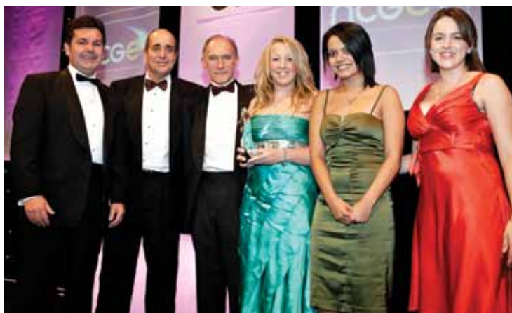
2008 Winners – University of Nottingham